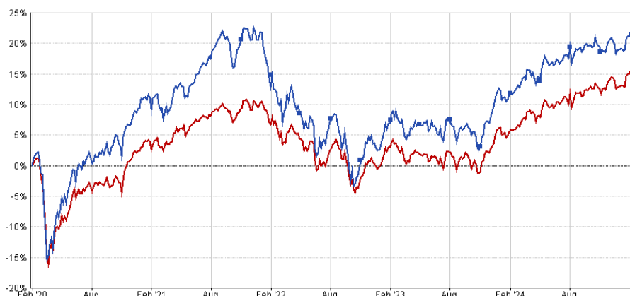
■ A - ***IMS Future Focused Cautious 01/11/2024 TR in GB (21.86%) ■ B - UT Mixed Investment 20-60% Shares Retail TR in GB (15.51%)

31/01/2020 - 31/01/2025 Data from FEfundinfo2025